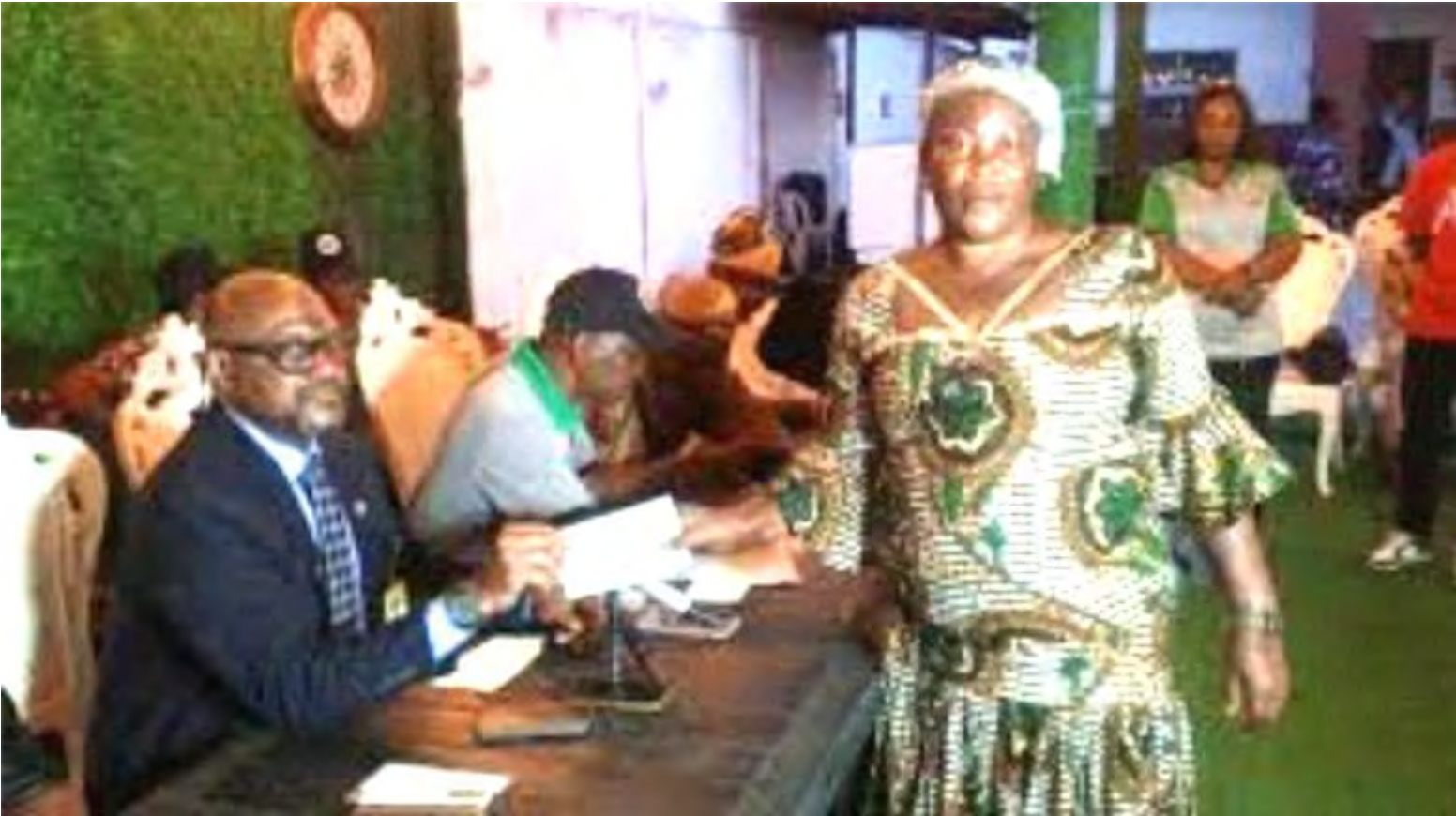
Demolition victim receiving compensation cheque

implemented over the years; in 2021, payments were made for properties affected by the Igbogbo-Igbe Road expansion. In 2024, over 1.5 billion was paid to more than 150 property owners affected by infrastructure projects, including road expansions and transport corridors. In 2025, residents affected by the