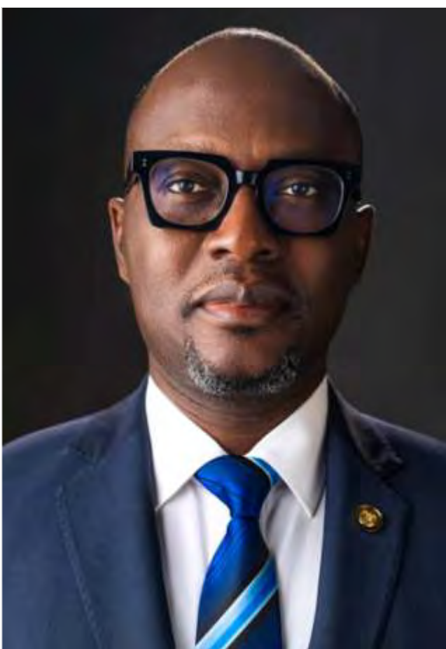
Dr. Muyiwa Gbadegesin

strengthening routine collection services and embarking on persistent clearing of identified flashpoints, which resulted from indiscriminate dumping and poor waste handling that continued to undermine progress in the sector. Encouraging the adoption of basic sorting practices across the board, the LAWMA boss emphasised the importance of waste sorting at source, explaining that separating recyclable materials from general waste would improve collection efficiency, support recycling activities, and reduce the burden on landfill sites. He highlighted LAWMA's growing focus on waste recycling, noting that